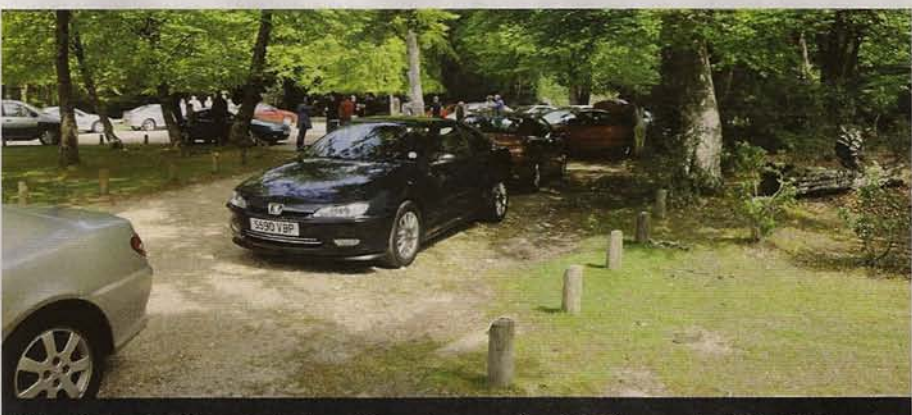
With an impressive 19 cars in attendance this meet soon overflowed the tiny car park at Rufus Stone