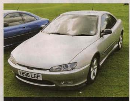
This Satellite Grey beauty belongs to Colin (aka V6_coupe) and features the classic Starfish wheels, a de-badged bonnet, a de-badged and de-locked boot, 607 style lion boot badge, induction kit... the list goes on

chat plus an air guitar demonstration by Steve, a door card removal/replace tutorial and an excellent meal at the nearby Walter Tyrrell pub. After lunch we moved off in convoy to assemble for a group photograph. An excellent video, by Glen Jevon, is available... simply go to the club web site at www.406CoupeClub.com and follow the links to 'Past Meets' where the videos and more images are available; alternatively the video can be viewed at www.youtube.com/ watch?v = 4MnsxSNfkrA&fmt = 18