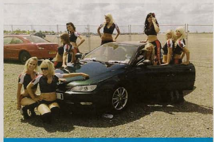
The Garo 406 Coupé proved popular at FCS09 and here is a picture of the Galileo Green and nine Flux babes